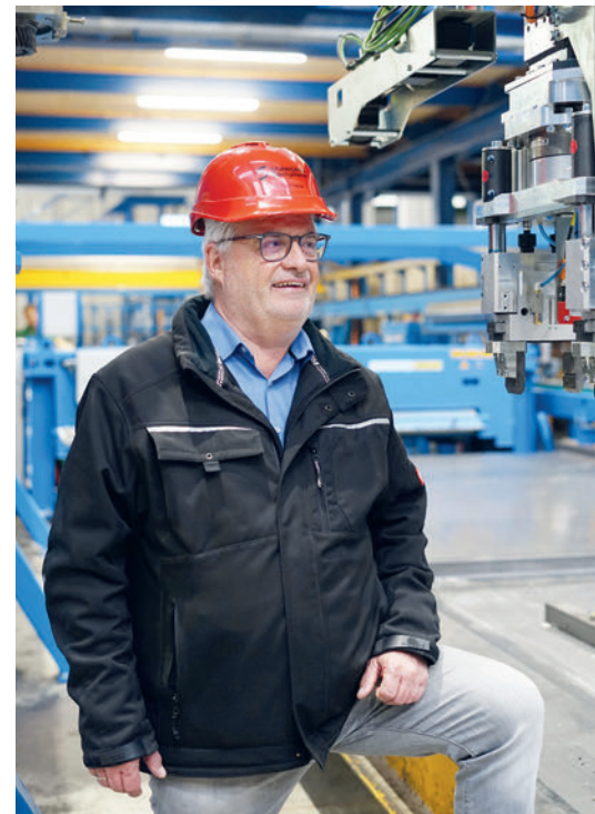
The individualised shuttering robot at Schwörer places the shuttering, magnets and assembly sleeves precisely on the pallet.