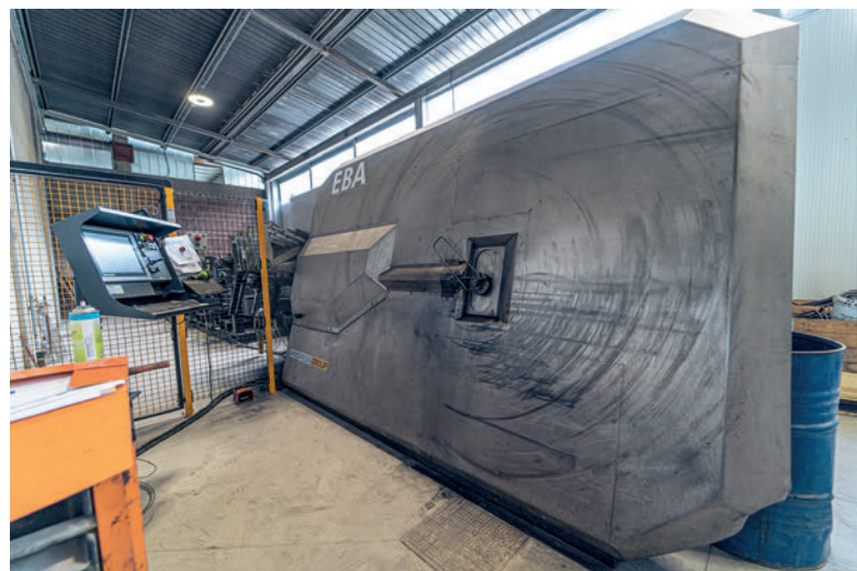
The EBA automatic stirrup bender produces stirrups in various shapes and sizes.