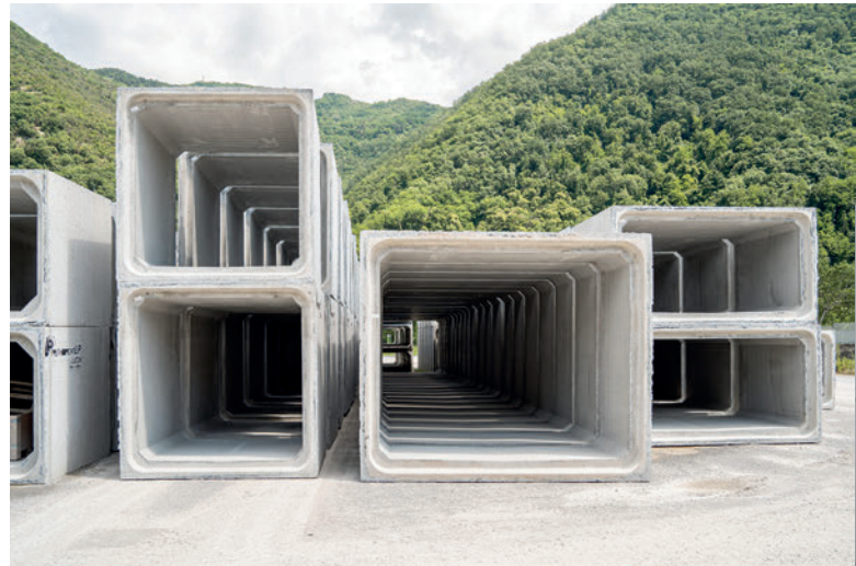
The products are used throughout Italy for large infrastructure projects such as motorways, bridges and railways.