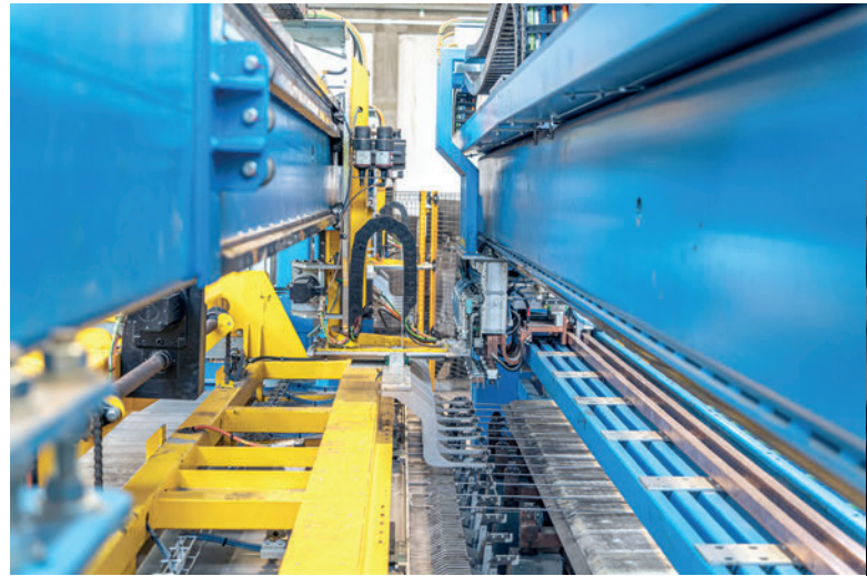
The possibility of welding longitudinal bars both at the top and bottom is an innovation developed for Prefabbricati LP.

integrated windows of different shapes and sizes. With the BlueMesh, Prefabbricati LP can produce meshes of up to 8 x 4 m. The plant can be used flexibly and can produce any type of welded mesh, also for reinforcement sales. The special requirement was to design a system in which the welding of the bars is possible from above as well as from below. This is necessary in order to comply with both the Italian Ministerial Decree 2018 for technical constructions in Italy and the Eurocodes II in relation to European regulations. These regulations require the installation of load reinforcement (transverse) within the structural elements, but also load distribution reinforcement (longitudinal) of about 20%. This must be embedded in the concrete core - one reason why Prefabbricati LP had to make these special demands on Progress Group. In this way, reinforcements are produced with welds of the longitudinal bars made both at the top and at the bottom, which means that the meshes now do not have